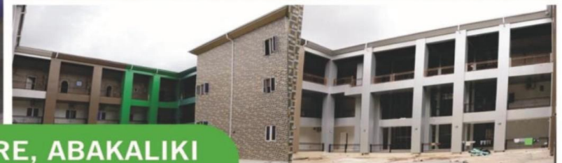
EBONYI STATE 300-BED COVID-19 ISOLATION/TREATMENT CENTRE, ABAKALIKI (Second location)