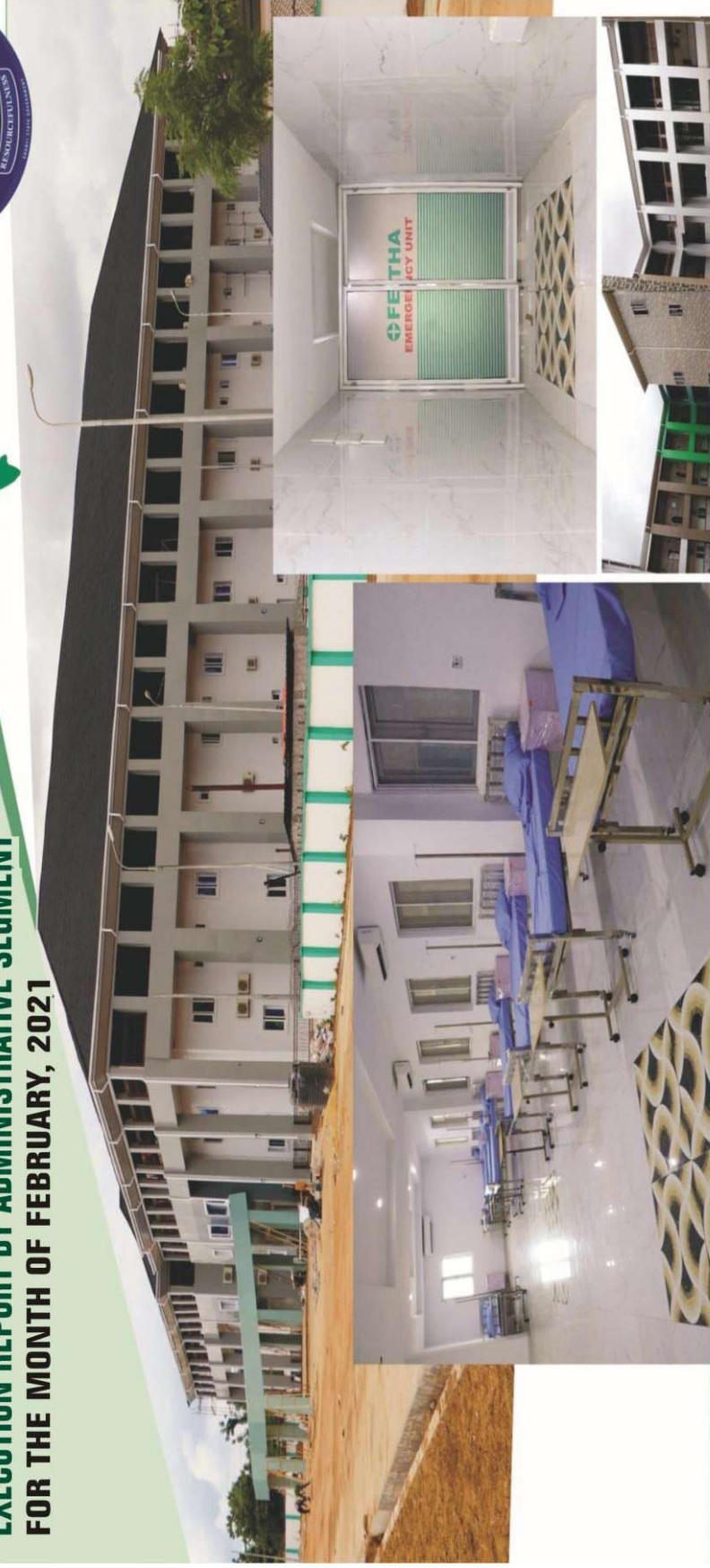
EBONYI STATE 300-BED COVID-19 ISOLATION/TREATMENT CENTRE, ABAKALIKI (Second location)