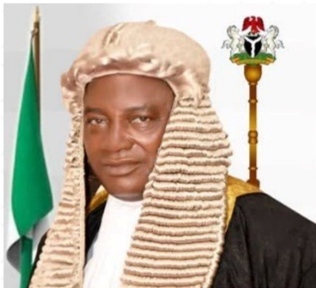
RT. HON. MOSES ODUNWA RT. HON. SPEAKER, EBONYI STATE HOUSE OF ASSEMBLY