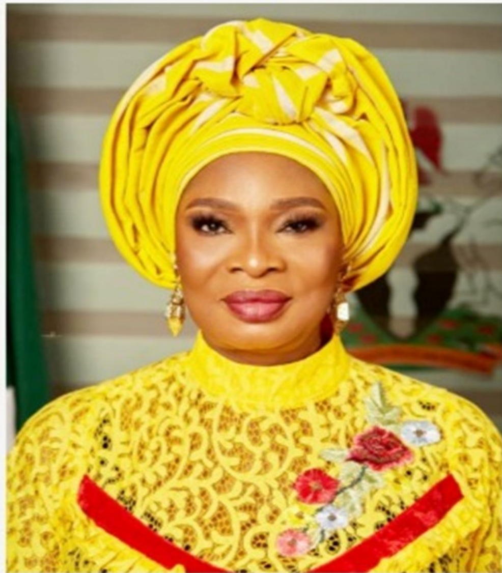
PRINCESS PATRICIA OBILA DEPUTY GOVERNOR OF EBONYI STATE