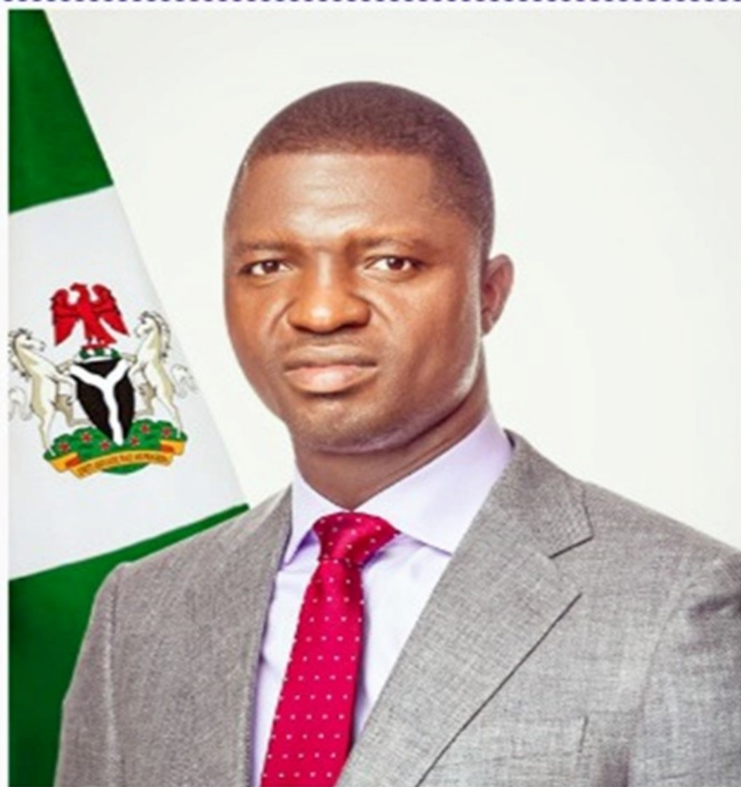
RT. HON. BLDR. FRANCIS OGBONNAYA NWIFURU EXECUTIVE GOVERNOR OF EBONYI STATE